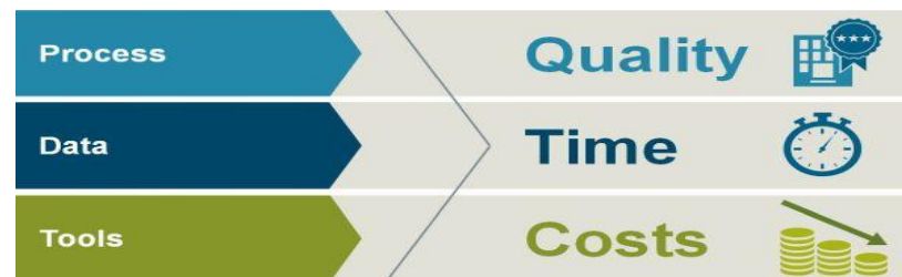
Figure: 2 Information Technology; Source

Retrieved from Survey of patient and physician influences and decision-making regarding CT utilization for minor head injury by Quaas et al., 2014, from Injury 45(9) pp. 1503-1508.